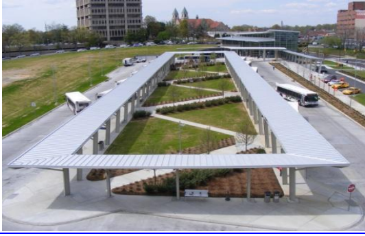
THE DURHAM STATION