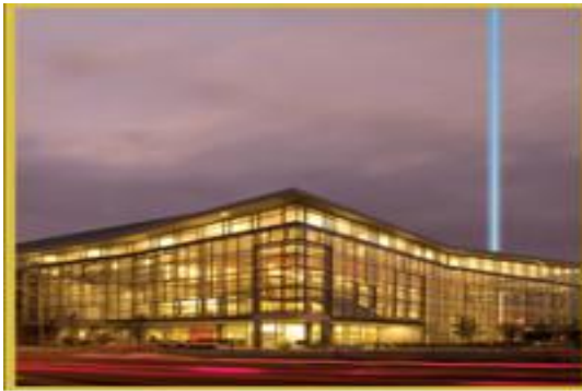
DURHAM PERFORMING ARTS CENTER