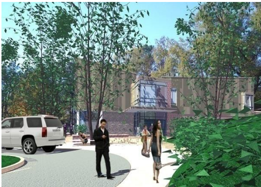
WALLTOWN COMMUNITY CENTER