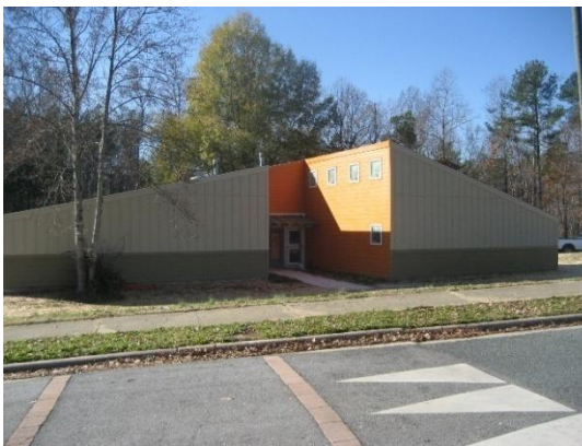
BIRCHWOOD COMMUNITY CENTER