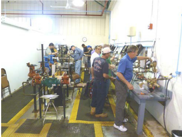
PRACTICAL “HANDS ON” WET LAB