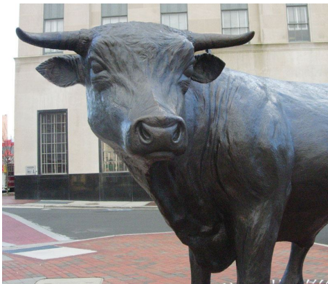
Major the Bull, 2004

This public art sculpture was part of the Bull City Sculpture Show.