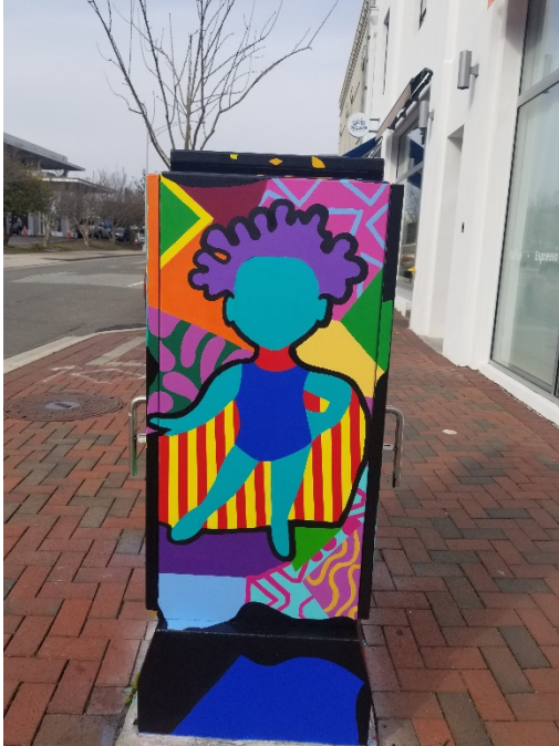
Candy Carver Traffic Signal Box 2018