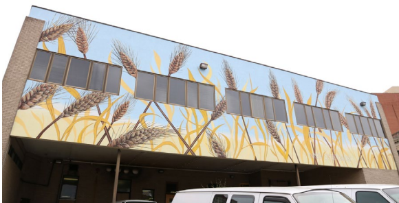
UNTITLED (NINTH ST. BAKERY) 2017

Major was cast in bronze and created from start to finish in Durham at Liberty Arts, a Studio and Foundry dedicated to enriching our communities with arts experiences that inspire, empower, educate, and entertain. The sculpture and plaza were gifted through a grant by The Central Carolina Bank to the citizens of Durham.