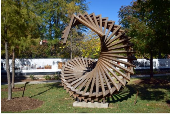
Winding Out, 2014