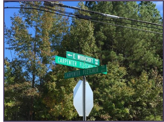
Intersection of E. Woodcroft Parkway and Carpenter Fletcher Road in Durham, Durham County.

The current proposed design would widen Carpenter-Fletcher Road on both sides, adding paved 5-foot bike lanes and 5-foot sidewalks. The existing right of way is variable. The design includes two 12-foot travel lanes, a 5-foot dedicated bike lane in each direction, a 2-foot curb and gutter, and a 5-foot sidewalk on both sides. The posted speed would be 35 miles per hour. Additional Right-of-Way may be required. The project will also require acquiring temporary construction easements and drainage/utility easements.