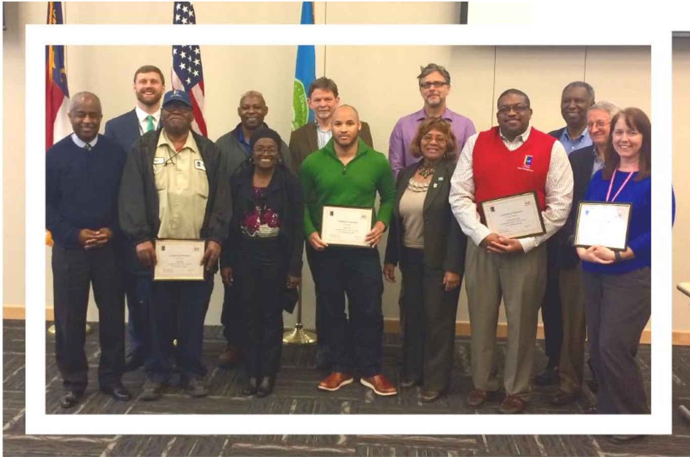
IdeaStarter Finalists recognized by City Council at February 2017 Budget Retreat